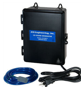
CPK-AIROXPROZONE (with ozone)

Start enjoying the Kenai AirOxPro difference today.